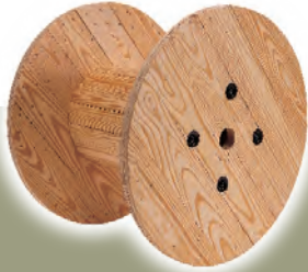
Nailed wood reels

Some of you may have known us as Baker Reels or Crellin. Today we are all Sonoco—one of the world's largest manufacturers of high-quality reels and spools. No other provider gives you a better combination of service, quality, strength and reliability—the combination that makes Sonoco best all around. While every wire and cable reel you buy from us is tailored to your unique specifications, it remains true to the high standards of a company that has valued and served its customers for more than 110 years.