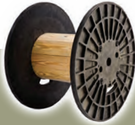
Polyfiber composite reels

Reel innovation for smooth inside flanges and improved weather resistance. Flange diameter sizes of 30" (762mm), 32" (813mm), 35" (889mm), 42" (1069mm), 45" (1143mm), 50" (1270mm); 100% recycled plastic composite flanges; returnable and recyclable.